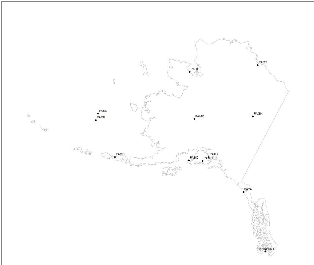
Figure B-2. Locations of ASOS stations in Alaska with missing June-December 2013 1-minute data files.